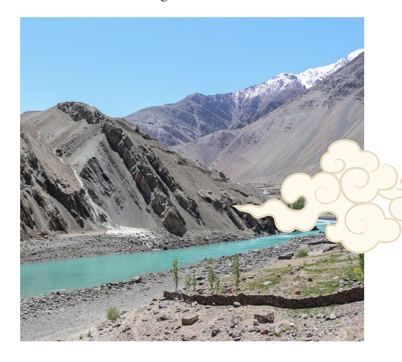
Day 3 Leh to Turtuk via Khardungla Pass

List of places visited – Alchi, Lamayuru, Pathar Sahib, Magnetic Hill, Hall of Fame.