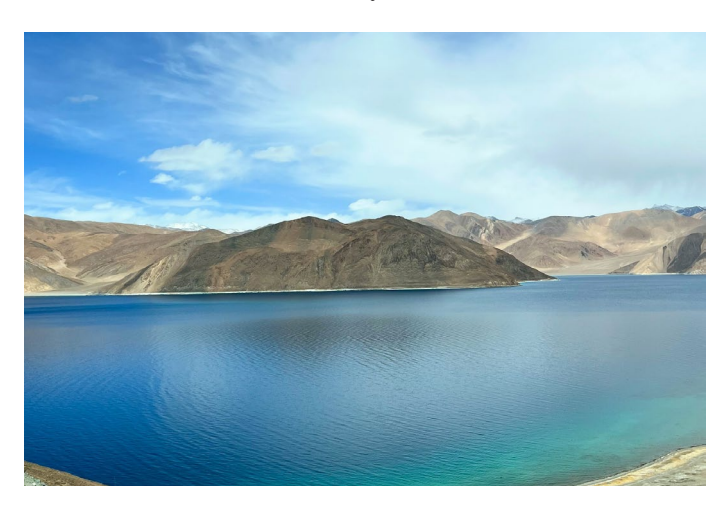
Day 7 Pangong Tso to Leh

The travel to Pangong Tso and the overnight stay.